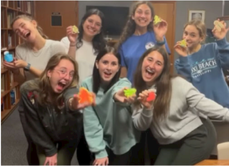
The ACTS Girls' Group recently got together to make and decorate Christmas themed cookies.