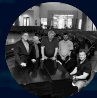
Broken Chains Band

April 15, 9:30 AM-4:00 PM Tickets-$40 4700 Palmetto Rd. Benton LA.