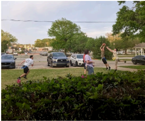
ACTS Guy's Group spent their last event enjoying the good weather on the lawn and serving food for St. Vincent de Paul.

Just in time for Spring, ACTS members have been spending time caring for the Mary Garden with the help of parishioners and the Men's Club. Continuing this theme, ACTS will be participating in the schools Big Event this coming Saturday. This is a wonderful event to give back to the community in Ruston.