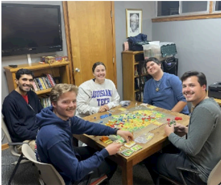
ACTS students enjoying the center and the board games we have here!

For more information, please visit: stac-acts.com