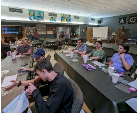
ACTS students spent the most recent guys' and girls' groups together learning how to sew buttons and hem clothing thanks to some wonderful parishioners!

This evening at the student mass, we will be recognizing our ACTS graduating seniors who served on the leadership team. These seniors have put in countless hours to make our organization the best it can be. The following week we will be continuing our finals week preparation with the pancake dinner on May 11th.