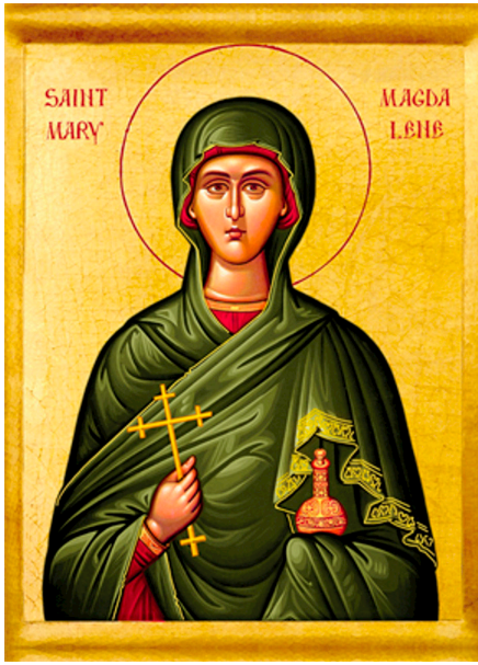
Saint of the Week