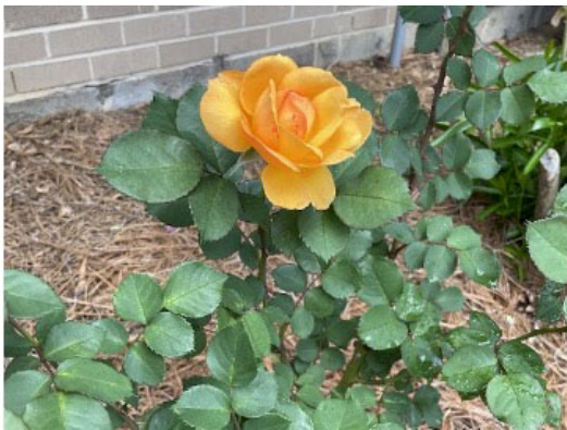
Mary Garden blooming in the spring to send off our students!

School is out for the summer! ACTS members will be going their own ways until we can meet up again in the fall. From Utah to Mississippi, we will have members working and living all over the U.S! We are sad to see our wonderful seniors leaving us this year but are hopeful for their futures and the chance to see them again soon!