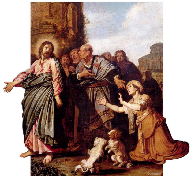
O Woman, Great is Your Faith! Matthew 15:28