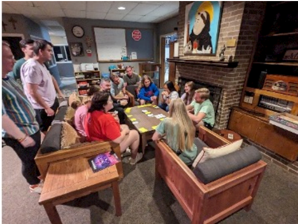
Students gathered on the first day of classes to have a game night in the E. Donn Piatt Catholic Student Center.

For more information, please visit: stac-acts.com