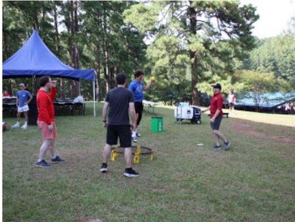
Students playing spike ball at the last home game tailgate!

Our ACTS leadership team and returning members alike have been thrilled to be meeting so many new people with the start of this new school year. We cannot wait to see what the rest of this year brings, and whatever it is, it's going to be wonderful! Be sure to follow the Instagram @latech_acts to stay up to date!