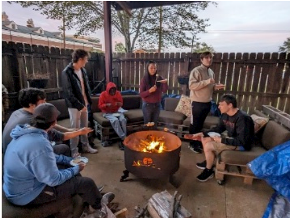
Freshman Crossing took advantage of the cooler weather and has a s'mores night!

For more information, please visit: stac-acts.com