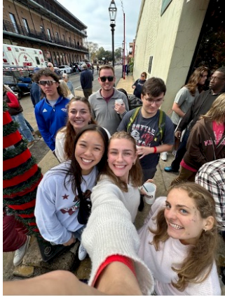
The ACTS group went to the Natchitoches Lights Festival and enjoyed touring shops and restaurants, and watching the wonderful fireworks show over the river

As quickly as all the students came back from Thanksgiving break, they now leave again for Christmas break on Wednesday.