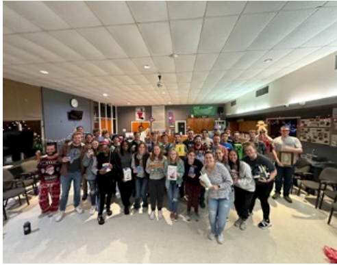
Everyone showing off their gifts at the White Elephant party on St Nicholas's Feast Day!

The students at LA Tech are all back home for the Christmas Break!