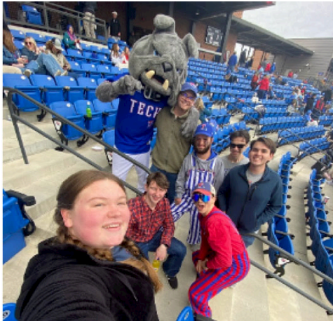
The students like to attend the Tech baseball games often!

ACTS students do not have classes until Tuesday, since they are off for Easter. They will be spending good time over the weekend celebrating the resurrection.