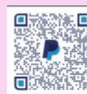
Scan to donate

En el Evangelio de hoy Jesús llamó a los Doce y les dijo: "Si alguno quiere ser el primero, que sea el último de todos y el servidor de todos." Luego, tomando a un niño, lo puso en medio de ellos, lo abrazó y les dijo: "El que reciba en mi nombre a uno de estos niños, a mí me recibe. Y el que me reciba a mí, no me recibe a mí, sino a aquel que me ha enviado." Tu donativo a la Sociedad de San Vicente de Paul ayudará a niños que tiene hambre sentir los brazos de Jesús alrededor de ellos.