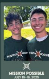
MISSION POSSIBLE JULY 16-19, 2025

DETAILS AND REGISTRATION AT SHVCAMPS.COM