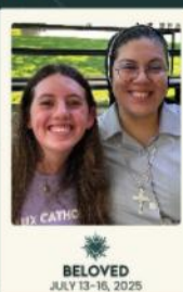
BELOVED JULY 13-16, 2025

✠ DIOCESE OF SHREVEPORT 2025 SUMMER CAMPS